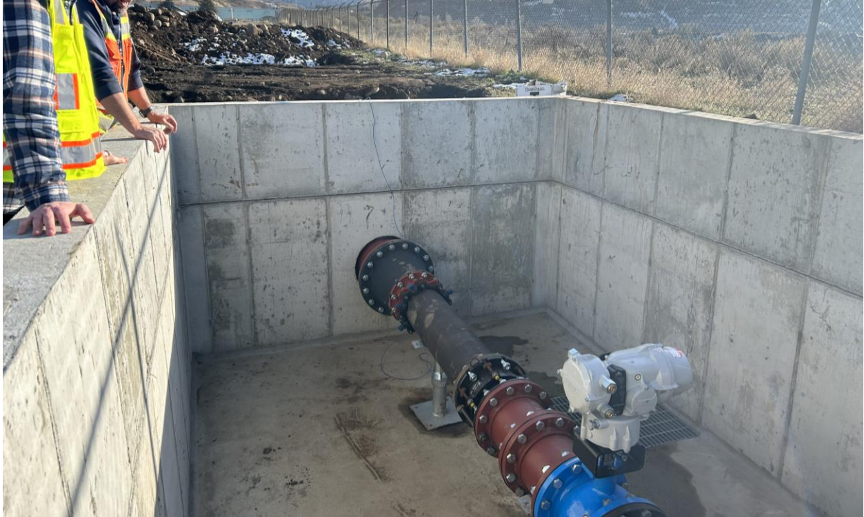
December 13, 2023: The SIB meter vault is installed.