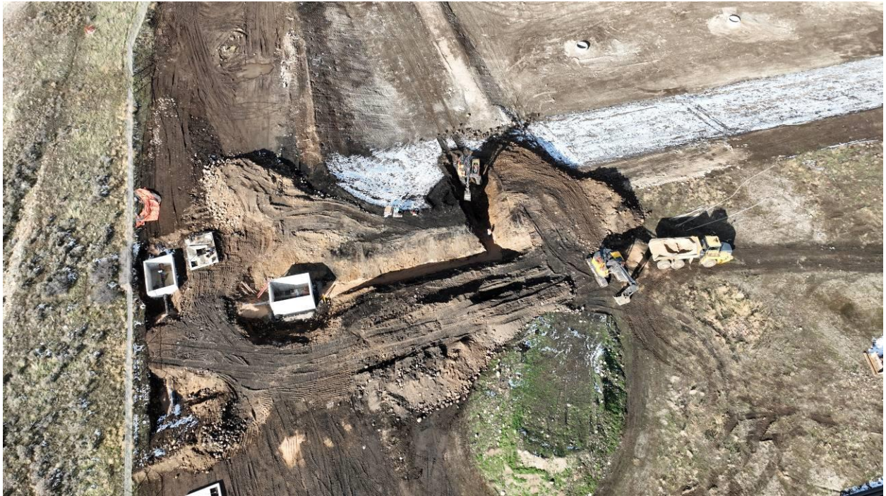
December 13: Meter vaults and piping were installed into the SIBs.