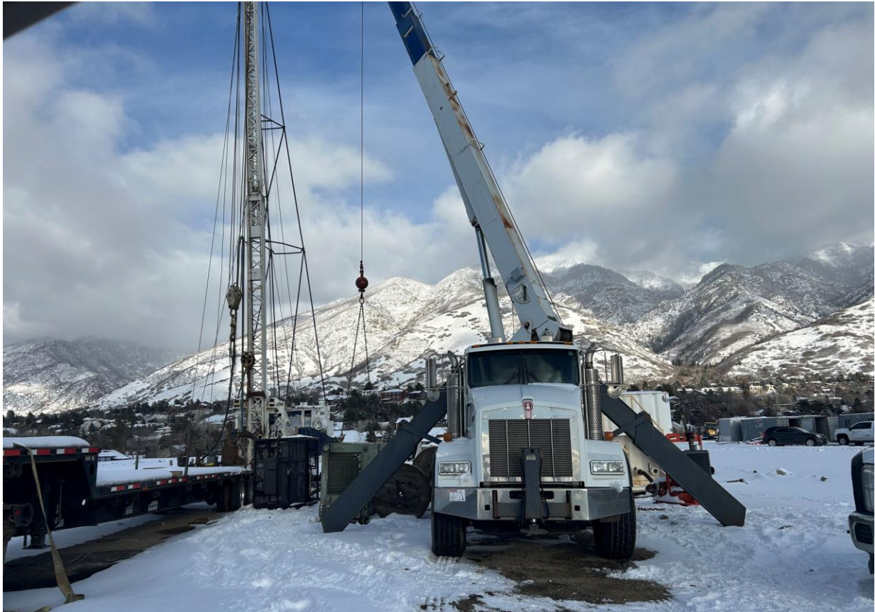
January 8, 2024: Well development is ongoing.