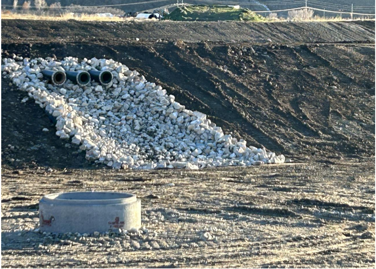
December 6: Overflow piping and rip-rap was installed between the south and north SIBs.